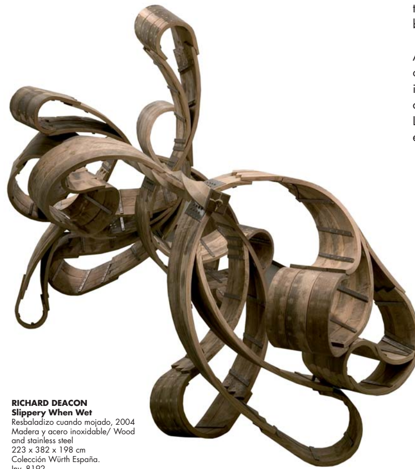
RICHARD DEACON Slippery When Wet Resbaladizo cuando mojado, 2004 Madera y acero inoxidable/ Wood and stainless steel 223 x 382 x 198 cm Colección Würth España. Inv. 8192

On September 7, 2005 the logistics center was inaugurated and on March 16, 2007, the building was officially opened.